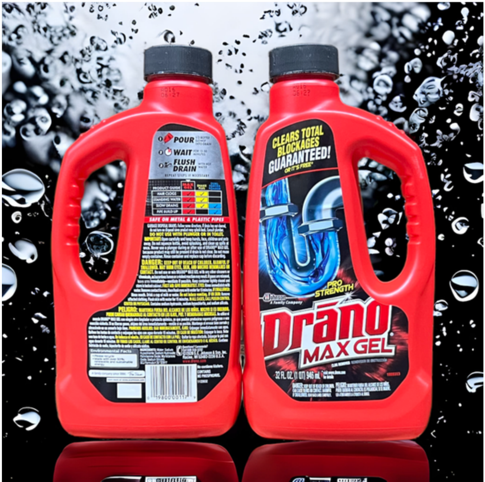
DRANO MAX GEL CLOG REMOVER 12/32OZ