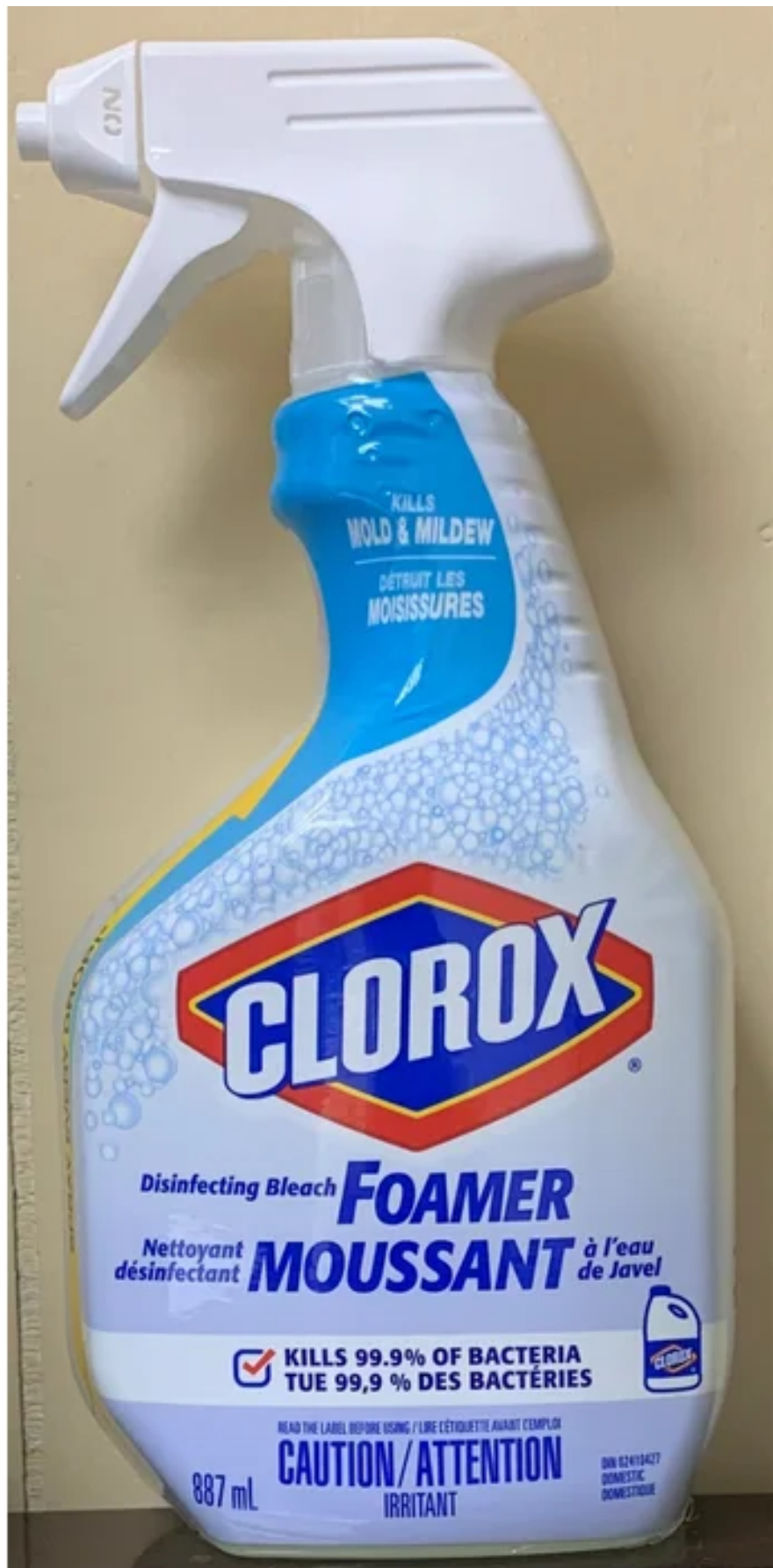
CLOROX DISINFECTING BLEACH FOAMER 9/30OZ