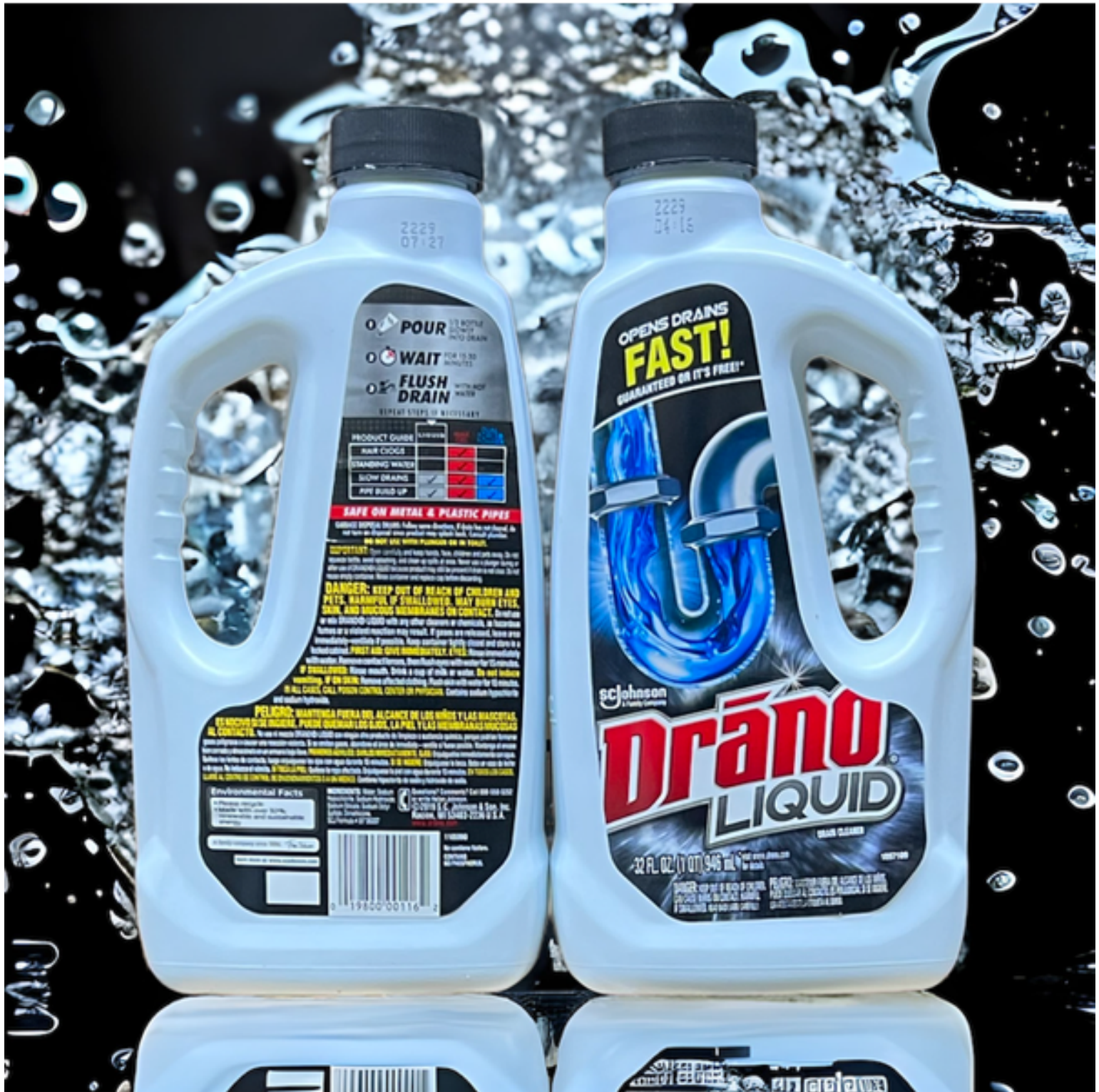
DRANO REG LIQUID CLOG REMOVER 12/32OZ